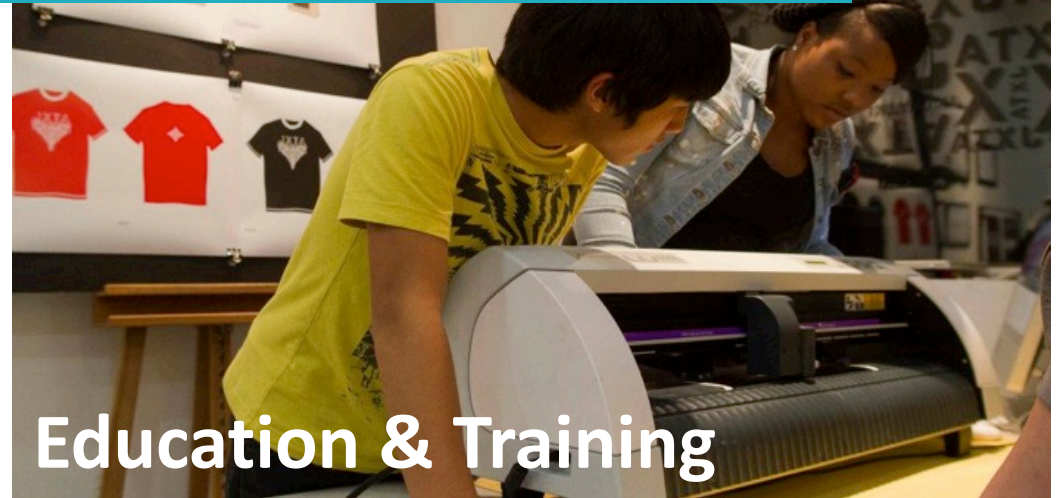
Education & Training