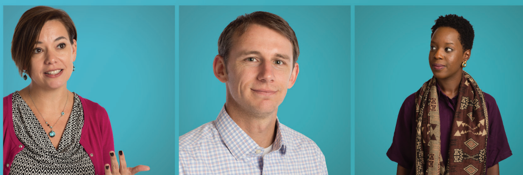
Team from Ohio

"I am invigorated to be part of a network of academics and community partners united by the potential for collaborative research to create meaningful social change."