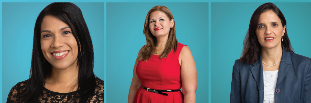
Team from Puerto Rico