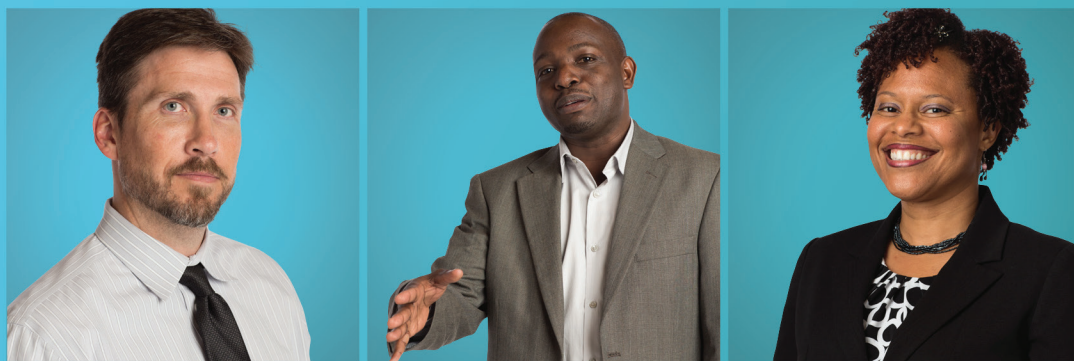
Team from Alabama

For teams of researchers and community partners APPLICATIONS OPEN IN JANUARY