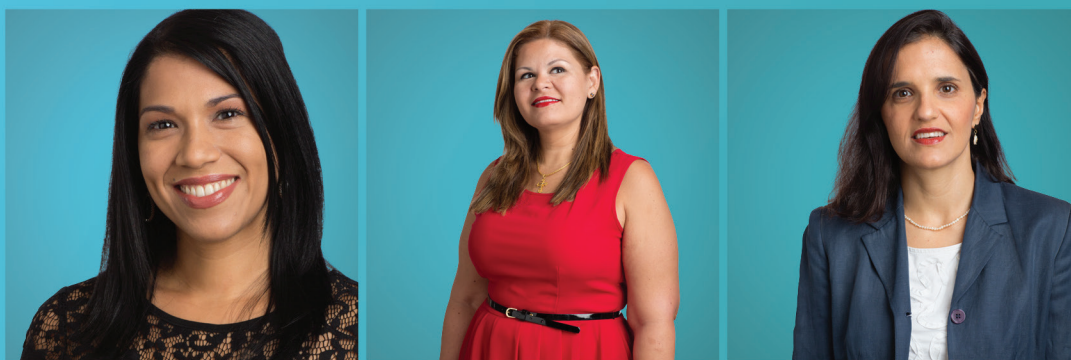
Team from Puerto Rico