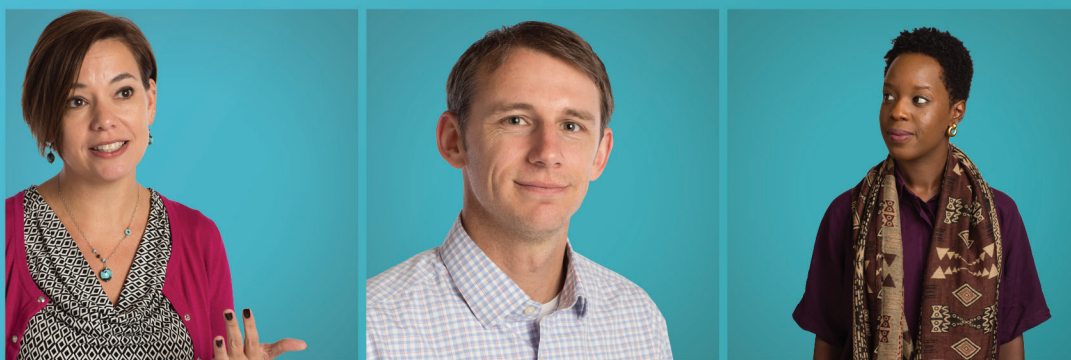
Team from Ohio