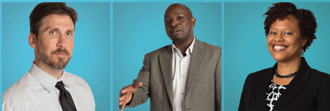
Team from Alabama